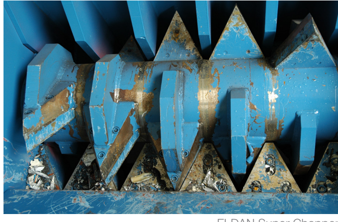
ELDAN Super Chopper

Used for recovery of metals from the organic (plastic) fraction.