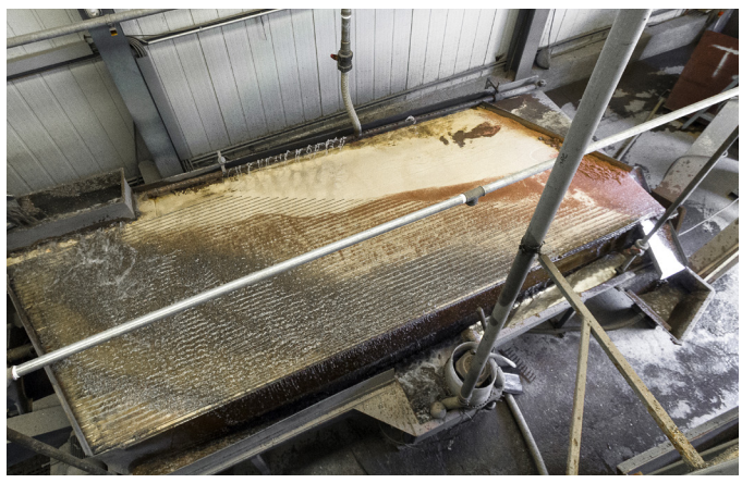
Water separation table