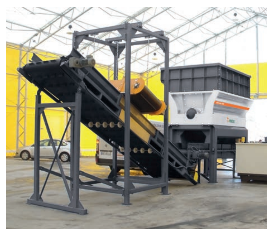
M&J PreShred 2000S

Metso shredder equipment is often used for processing waste. As waste flows can be heterogeneous with unpredictable and varying characteristics, there is heavy demand on stationary pre and fine shredding equipment. With their well-proven ruggedness, versatility and reliability, Metso systems are the equipment of choice for waste processing installations globally, and well qualified for input material such as, Bulky, Industrial (C&I), Household (MSW), Wood, Construction and Demolition (C&D)