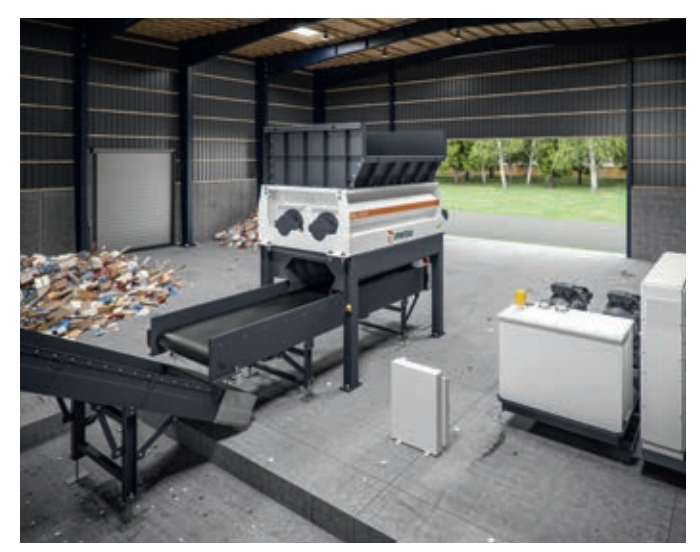
M&J PreShred 6000S